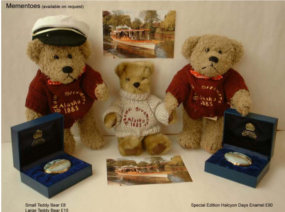
Small Teddy Bear £8 Large Teddy Bear £15