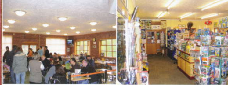
Eat at Aylsham 'Whistlestop'

For more information call in to Aylsham Station or ring 01263 733858. *Restrictions apply.