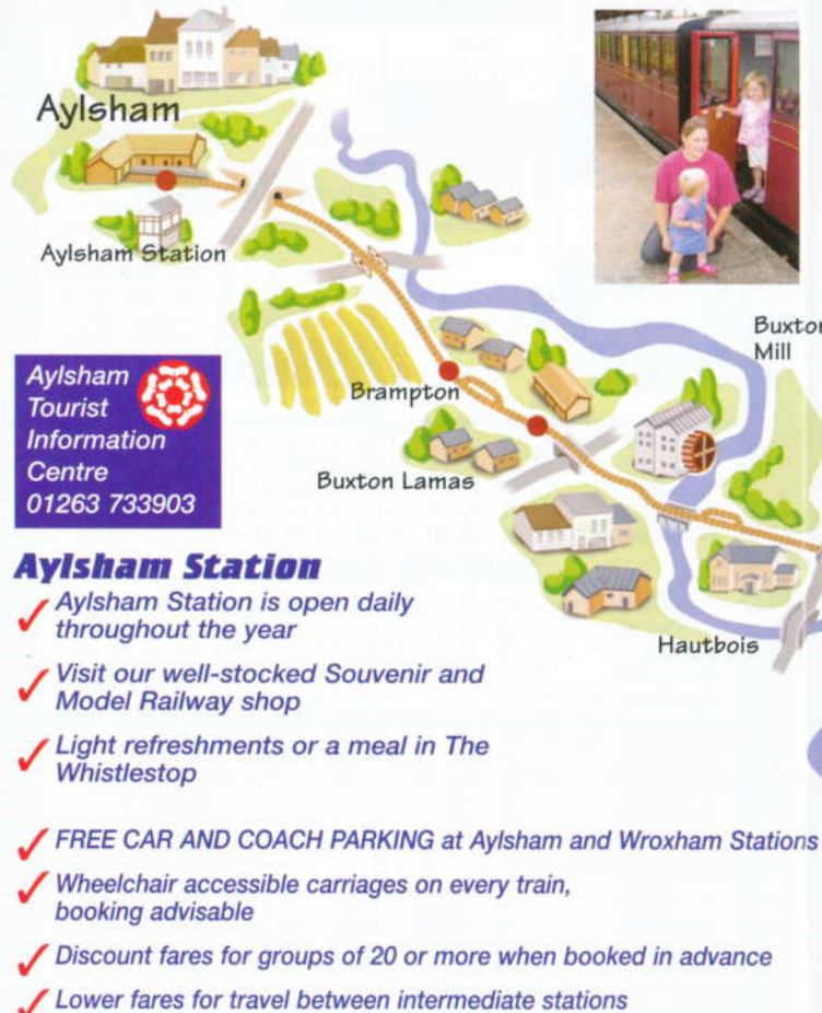
Aylsham Souvenir and Model Shop