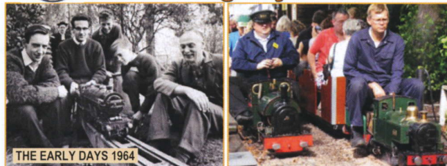
THE EARLY DAYS 1964

ALTHOUGH VARIOUS EVENTS AS LISTED HAVE BEEN PLANNED ON EACH RUNNING DAY DURING 2013 THESE MAY BE SUBJECT TO ALTERATION