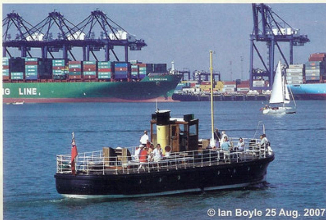
© Ian Boyle 25 Aug. 2007

View the busy ports of Harwich and Felixstowe from the water. There are views of Landguard Fort, Trinity House lightships and the harbour breakwater as well.