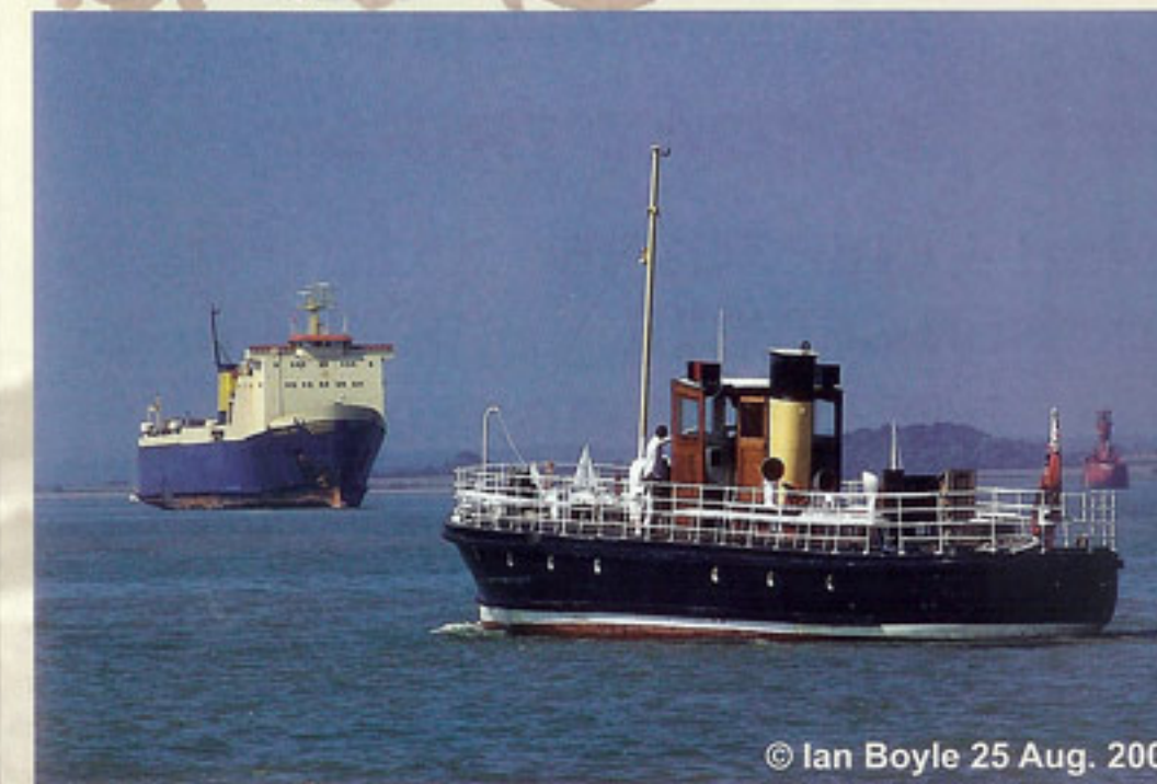
© Ian Boyle 25 Aug. 2007

Other charter trips are available both in and out of season. Please contact us or see our website for details.