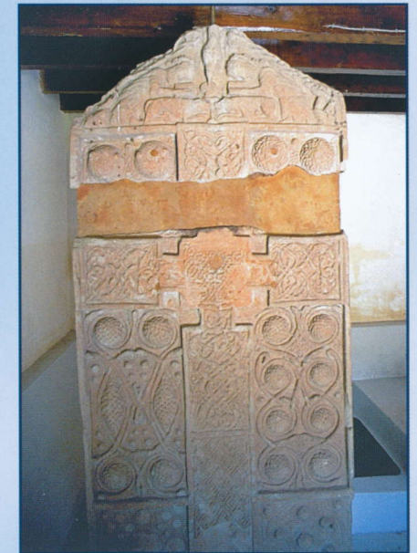
The Nigg cross-slab

The ninth century Nigg cross-slab, housed in Nigg Old Church, is a major work of European art and is part of the Pictish Trail.