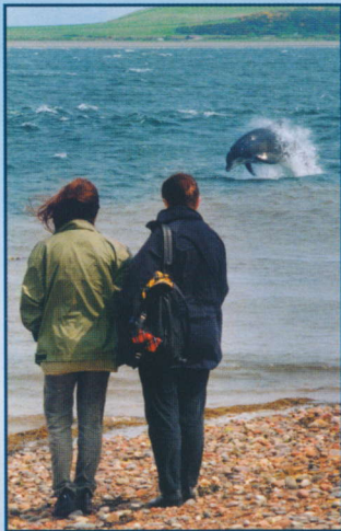
A Cromarty dolphin

When Cromarty's trade flourished at the end of the 18th century, large houses were built for successful merchants, side by side with the cottages of the fisher folk. This once busy port and commercial centre is now a uniquely preserved historic town.