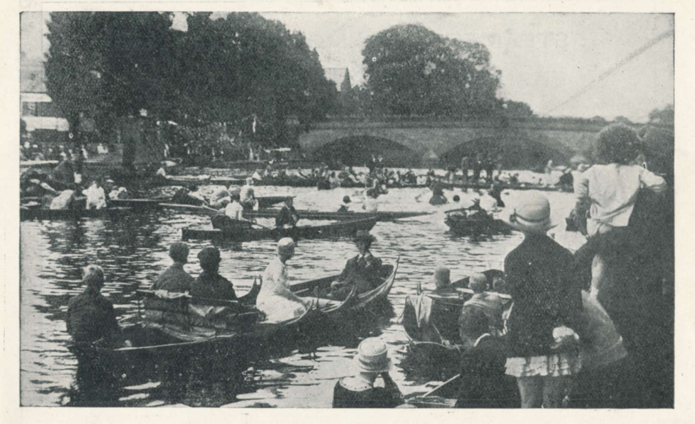
HOLIDAY SCENE OPPOSITE TEA GARDENS

The Avon Bridge Cafe adjoins the lovely Abbey Park and is opposite the Workman Pleasure Gardens. Both these parks and other recreation grounds have been beautifully laid out by the Evesham Borough Council, with facilities for tennis, bowling, putting greens, and the usual amenities of public parks. The children have a wonderful playground and bathing pool.