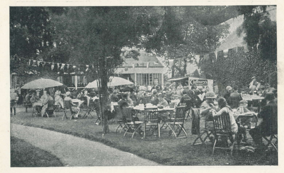
VIEW OF TEA GARDENS