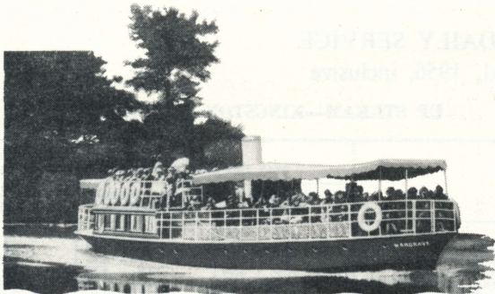
STEAMER EXCURSIONS ON THE THAMES

These Steamers afford opportunities of making excursions on the Thames on any day during the summer without the trouble of arranging in advance.