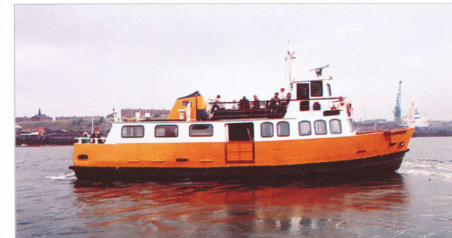
1972 Freda Cunningham

In 1929 there were eleven ferry routes across the Tyne between Newburn and the mouth of the river, now only what was known as the Market Place Ferry survives as today's Shields Ferry. This ferry boat service was taken over by Tyne and Wear Passenger Transport Executive on May 1, 1972. The ferry boats built to their order were: Freda Cunningham (1972), Shieldsman (1976) and Pride of the Tyne (1993) which are passenger only diesel ferries. The Freda Cunningham was taken out of service in 1993 and sold.