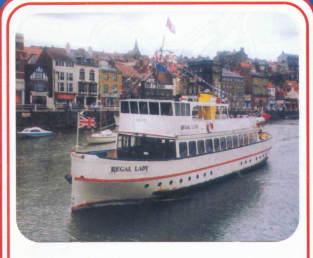
About the Regal Lady and Coronia...

When you are aboard our steamers your comfort and safety is always our first priority.