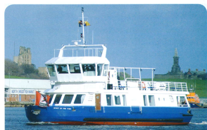
Spirit of the Tyne entered service 2007

Spirit of the Tyne is the fourth ferry to be commissioned following the Freda Cunningham in 1972, the Shieldsman in 1976 and Pride of the Tyne in 1993.